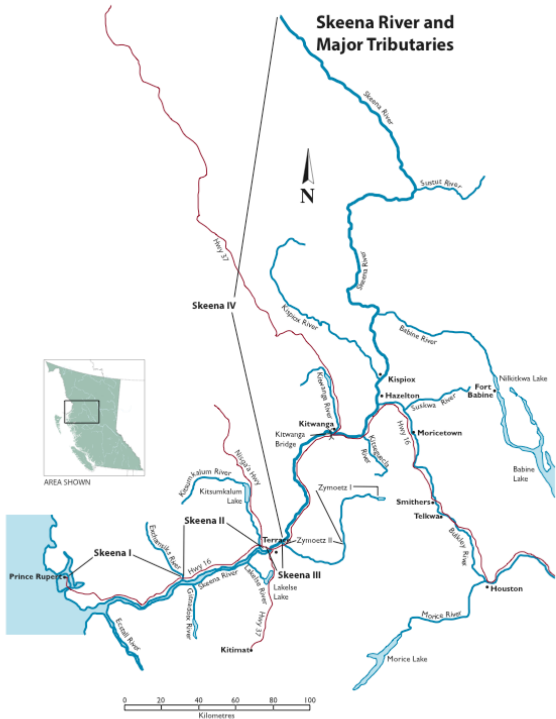
Figure 1. The Skeena River watershed, showing its main tributaries and the four sections of the mainstem Skeena River, and the two sections of the Zymoetz River (Dolan 2008).