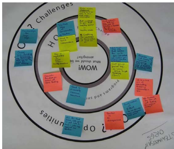
Figure 1. An example of the NOW, WOW, HOW exercise completed by the participant groups.

The exercise was effective, as participants were encouraged to generate lots of ideas by concisely writing their ideas onto small sticky notes, and placing them on a table top chart.